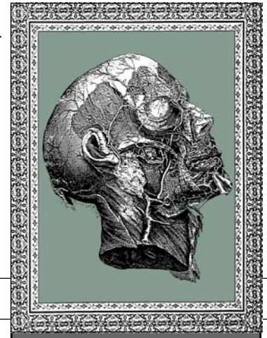
My Madness My Gift

took on the "2nd Edition Messages" project and worked directly with a premier printer to produce what is sure to be a trend setting work that will not only stand strong through the test of time but gain momentum as more of the literary community becomes aware of its presence.